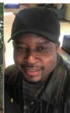
The Homeshare Team