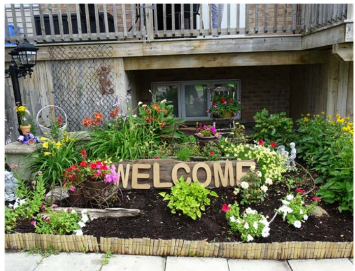
The Sydney Program was the overall winner!