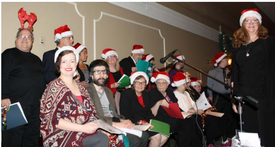
The Glee Club

Eventually it wasn't just a residential party but grew to include all the programs within OCAPDD. In the early 2000s the numbers continued to grow, as other organizations in the area as well as guests and family members attended.