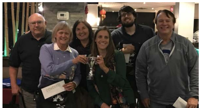
The Monagham Family