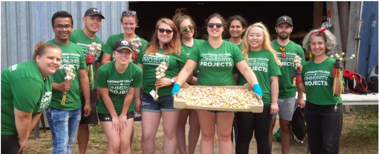
A volunteer group from Algonquin College.

Of course our many volunteers made this possible. Although we are always looking for more volunteers we had a number of new individuals, groups and companies join this wonderful project which has helped spread the workload. This great project is very much community based.