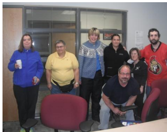
The Self-Advocacy Group