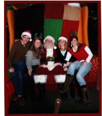
Dows Lake Ward

We would not be able to do this without special caring people.