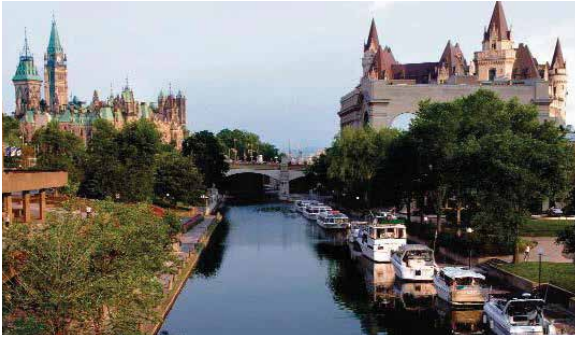
Rideau Canal - Ottawa, ON