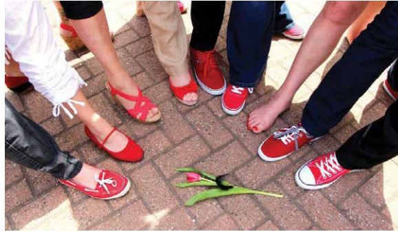
Putting Our Best Foot Forward