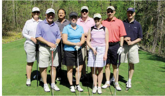
Many Conference Delegates enjoyed a round of golf at Hautes Plaines